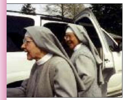
All the Sisters remember their bright smiles of "until we meet again, be at peace!"